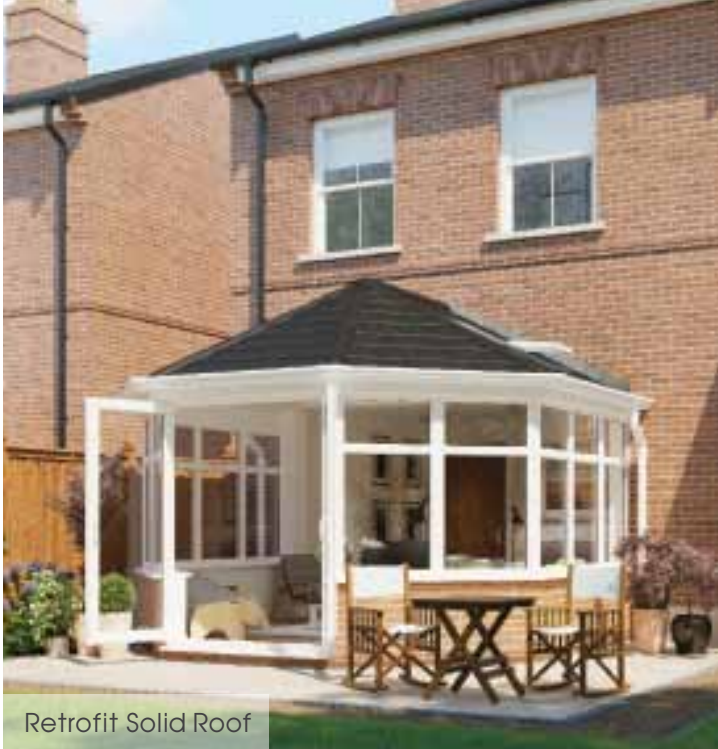
Retrofit Solid Roof